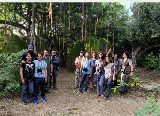
Capsule Course- Batch V 2024