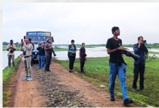
Capsule Course- Batch X 2025