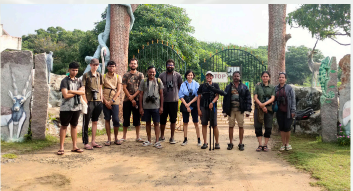
Capsule Course - Batch VII 2024