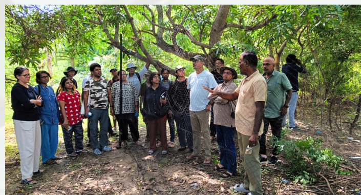
Capsule Course on Field Ornithology & Bird Migration Studies - Batch VI 2024

Bus Station - Vedaranyam (11 km) – Frequent buses from Trichy during the daytime Daily bus services are available from Chennai.