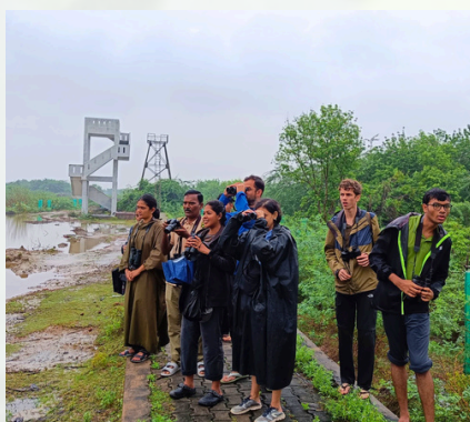
Capsule Course - Batch VII 2024