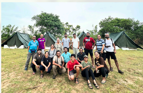
Capsule Course - Batch III 2023