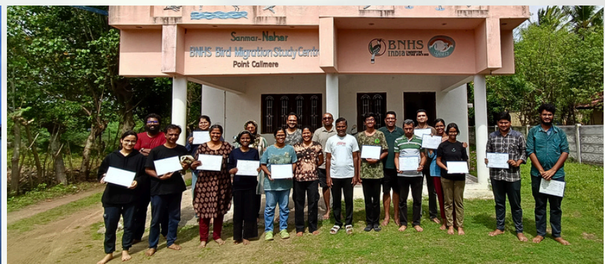
Capsule Course- Batch IX 2024