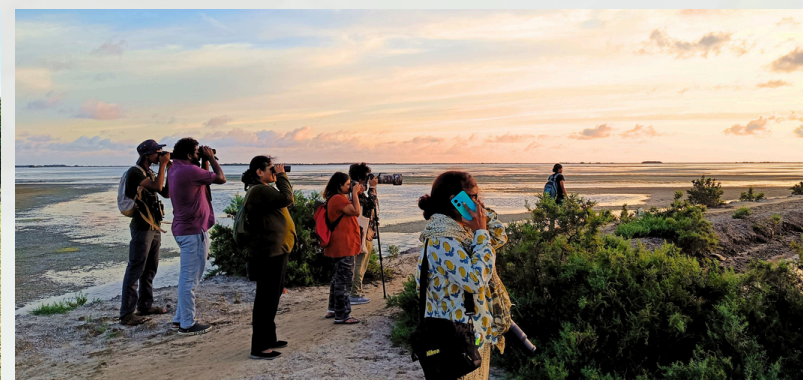
Capsule Course - Batch VI 2024