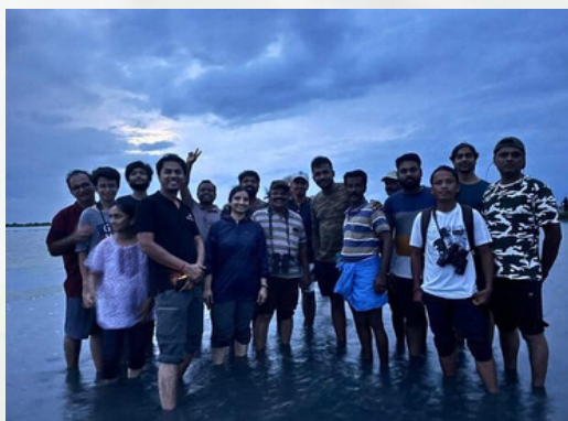
Capsule Course- Batch I 2022