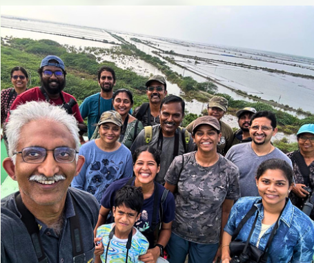
Capsule Course - Batch VIII 2024 ©Premkumar